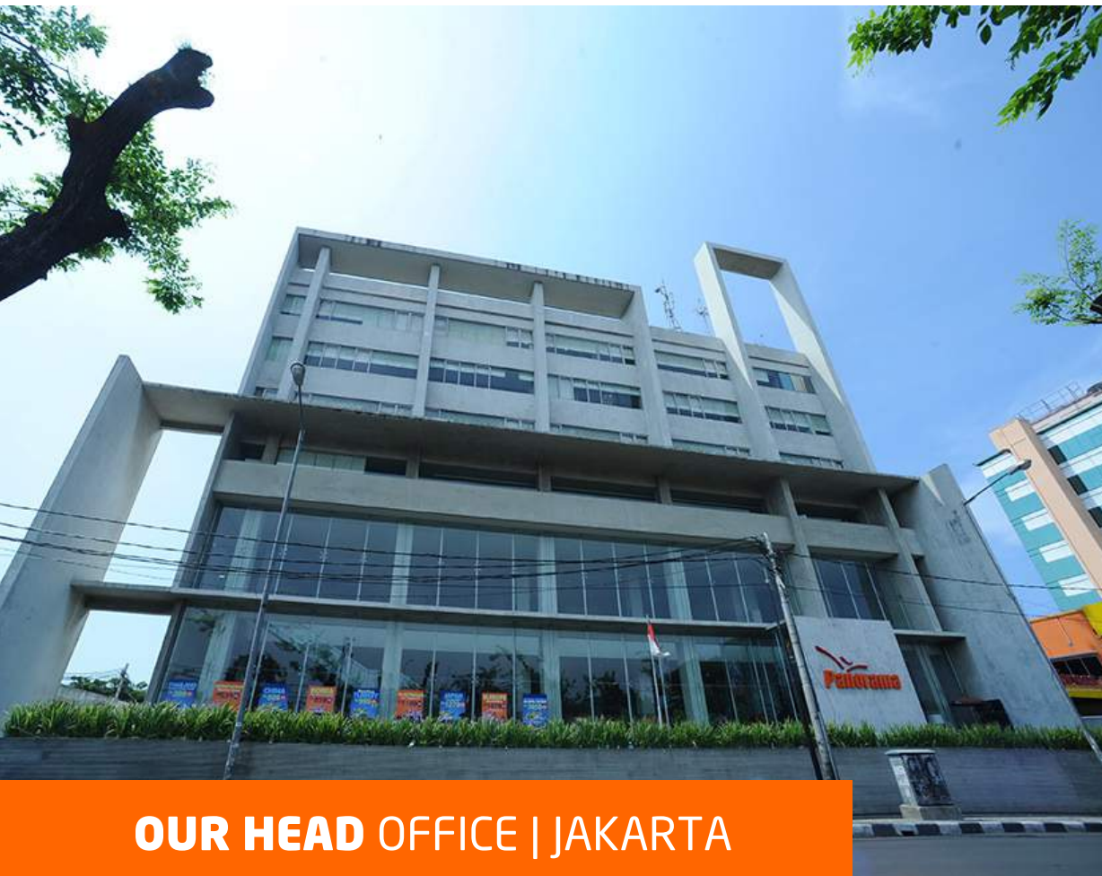
OUR HEAD OFFICE | JAKARTA