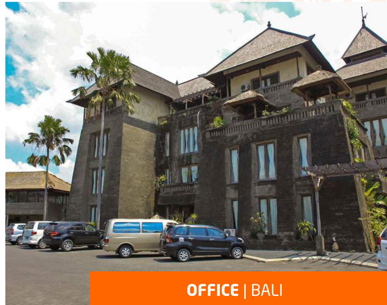
OFFICE | BALI